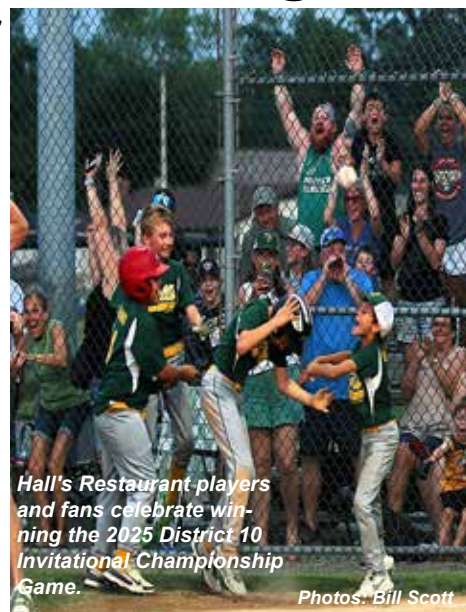
Hall's Restaurant players and fans celebrate winning the 2025 District 10 Invitational Championship Game.